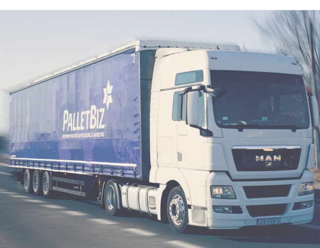
CURRENTLY WITH MANUFACTURING AND REPAIR CENTERS THROUGHOUT EMEA READY TO SERVE YOU